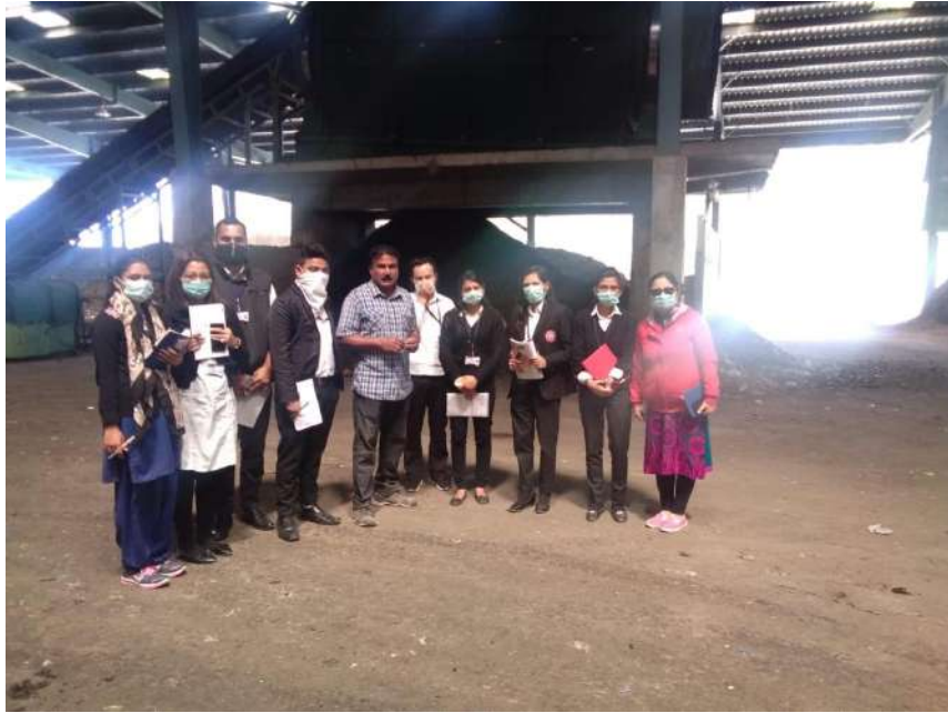
National Science Day (28/2/2019)