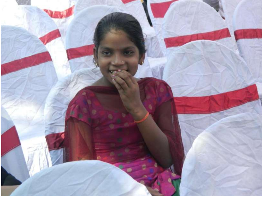
The victim of rape been rehabilitated by LEGAL AID CELL