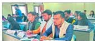
उत्तराखण्ड विद्या विमानन में आवेगित नर में प्रतिभान काने नर।